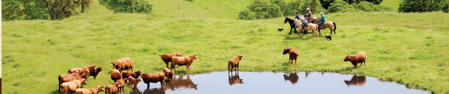
KOOPMANN RANCH, SUNOL.