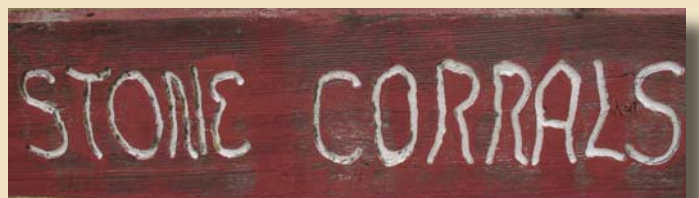
Stone Corral Ranch sign at entrance gate.