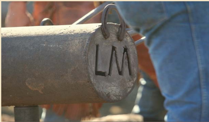
Maddalena Ranch Brand

The Sierra Valley in Northern California is like no other. In fact, it is the largest Alpine Valley of its kind in the country. Now 750 acres of this special place, on the Maddalena Ranch, will forever remain home to these environmental riches, a family cattle operation and its future generations. The Maddalena Ranch has been protected from future development through a conservation easement with the California Rangeland Trust.